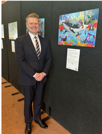
Menzies young artists' work