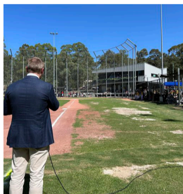
Doncaster Dragons Baseball Club celebrates 50 years