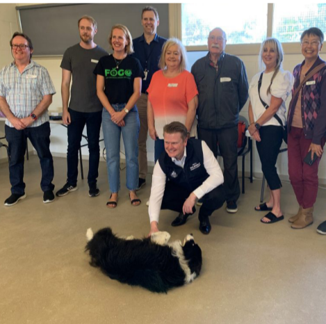
The hard working FOMDAC team