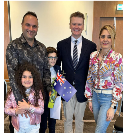
Australia Day ceremonies