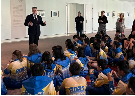
Beverley Hills Primary School (L) and St Gregory The Great (R) visit Parliament House