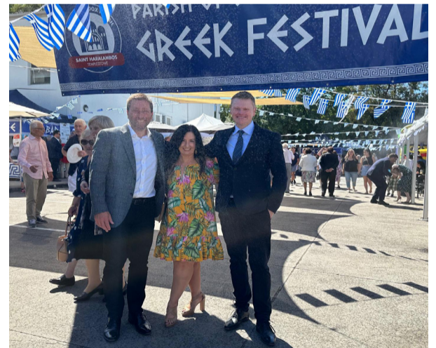
Festival of St Haralambos in Templestowe