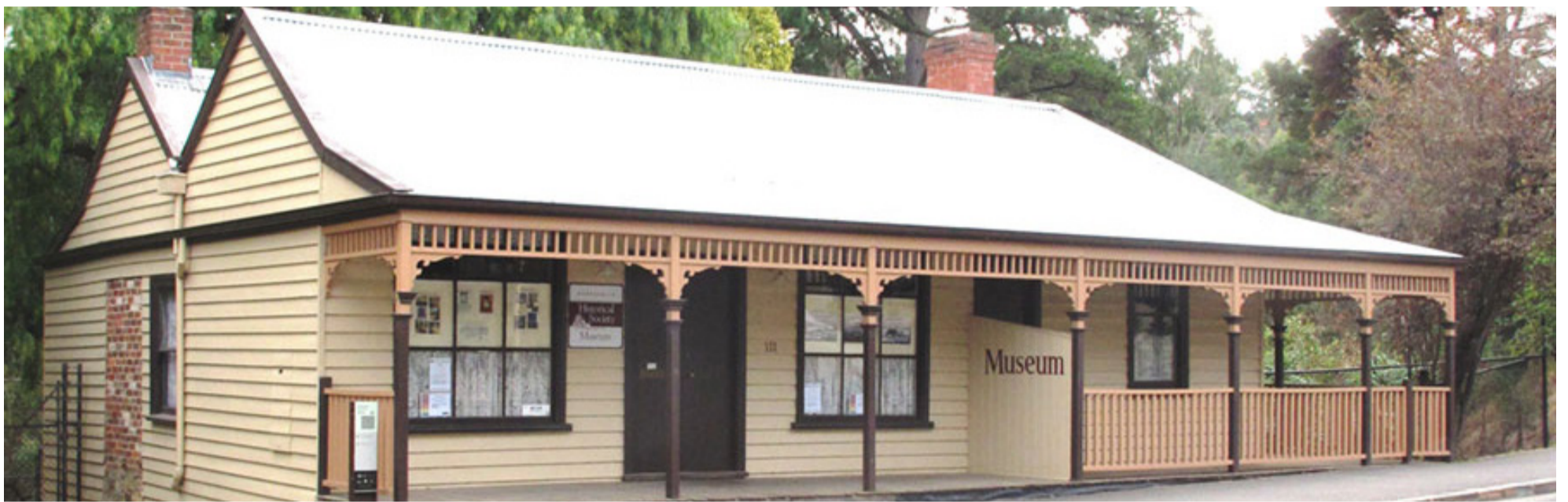
Exterior of Old Post Office Museum from Yarra Street

Telling the story of the Wurundjeri Woiwurrung people of the area, the discovery of gold in 1851, artists and domestic life of years gone by, the Old Post Office Museum is open every weekend between 1:30-4:30pm.