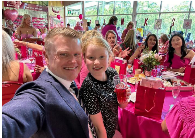
Warrandyte Pink Stumps Day with WCC