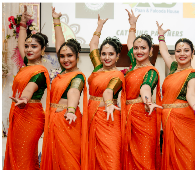
Dancers pose at the AICSI Eastern Diwali Festival