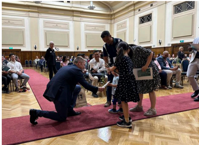
Menzies welcomes its newest Australian citizens