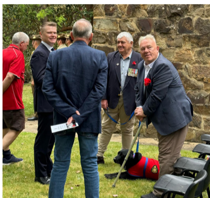
Remembrance Day ceremony in Warrandyte