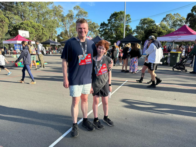
WCB Run Warrandyte 2024