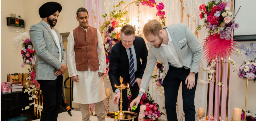
Australian Indian Cultural Society Incorporated celebrates Diwali