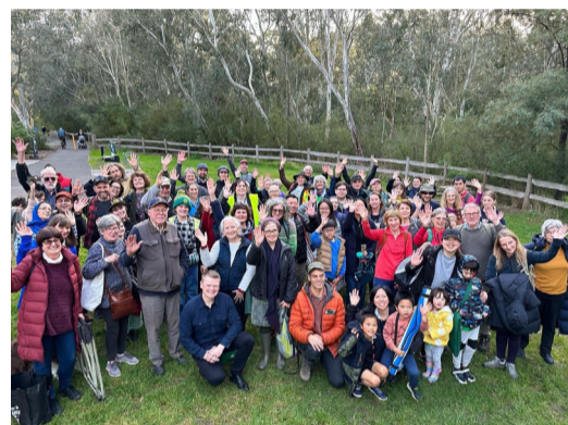
ACF volunteers gather at Wombat Bend in Templestowe