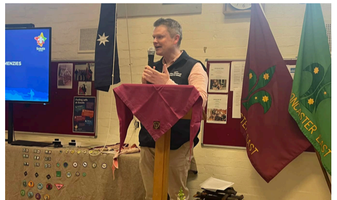
3rd Doncaster East Scout Group celebrate their 60th anniversary